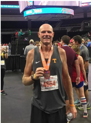
South Dakota #17 Marathon