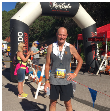
Colorado #16 Marathon